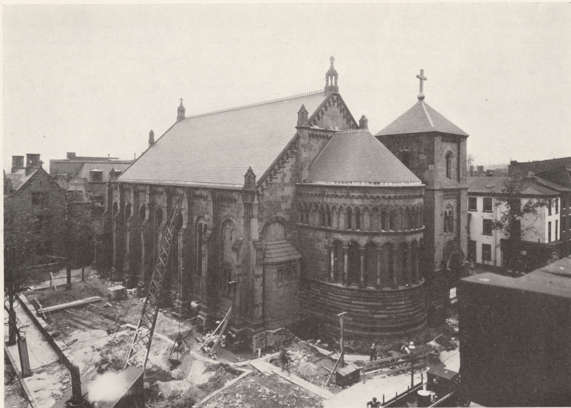
Foundation exposed, before laying tracks