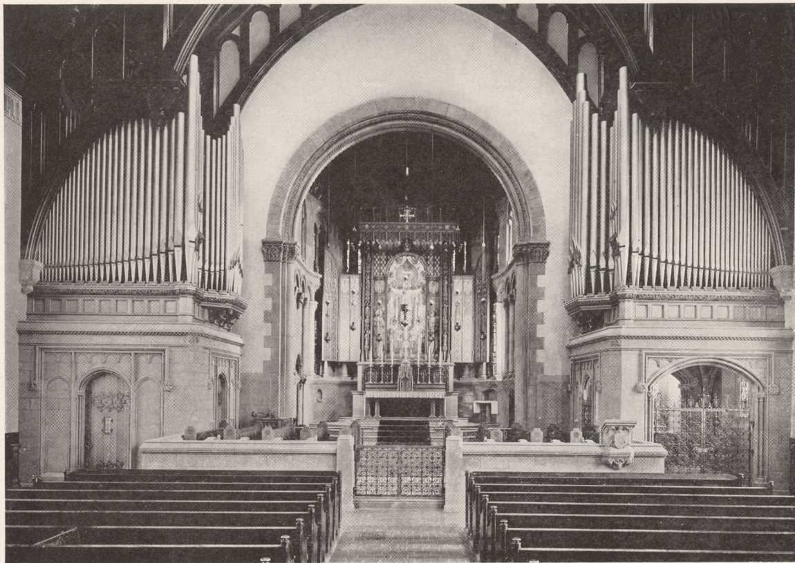
Interior, unaffected by removal